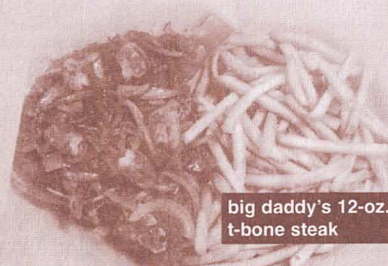
big daddy's 12-oz. t-bone steak

Sliced chicken breast cooked with grilled onions and mushrooms, topped with shredded cheese. Served with tortillas - 7.99