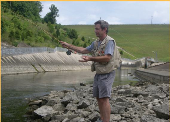
Brookville Lake’s downstream area attracts trout fishing enthusiasts.