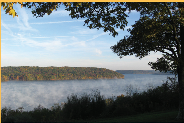
Rolling hills, lush vegetation and sparkling water greet visitors to Brookville Lake. The reservoir also safeguards downstream communities and has reduced flood damages in these areas.

The recreation facilities at the lake are operated and maintained by the State of Indiana Department of Natural Resources (IDNR), with the exception of the Dam, Tailwater and Overlook Recreation Areas, which the Corps operates and maintains. Recreation facilities include beaches, boat ramps, campgrounds, fishing piers, an 18-hole golf course, hiking trails, lodging, marinas, picnic areas, playgrounds, restaurant, shooting & archery ranges and a tailwater trout fishing area.