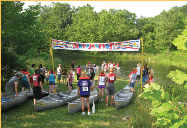
If you like to canoe, Indiana’s largest canoe race, Canoe fest, is held once a year starting at the Tailwater Recreation Area.